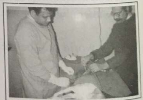
Stray dog being sterilized

The Blue Cross is dedicated to the ABC/AR as a humane and scientific method of stray animal control. We were able to continue the programme full swing sterilizing 6082 stray dogs and vaccinating 7875 stray dogs against rabies. The ABC/AR project is led by Dr. Ramana Rao who operates night and day to ensure as many stray dogs can be helped. In addition to this, anti rabies vaccination camps in slum areas are conducted regularly to demark rabies free zones. A seminar was conducted on 26th Feb 2000 to sensitize the Government of A.P. to the effectiveness of the ABC/AR. A detailed booklet on the ABC/AR was brought out after the seminar. The book is available on request.