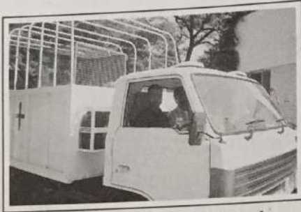
Ambulance sponsored by the Ministry for Social Justice & Empowerment

2334 sick, abused and injured birds and animals were rescued and treated at the Blue Cross. Financial aid from the Ministry for Social Justice & Empowerment helped us in the purchase of a new ambulance and complete construction of the rescue home.