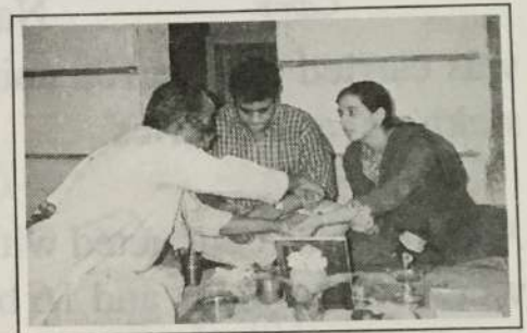
Puja at shelter