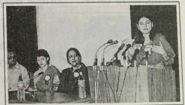
Mrs. Maneka Gandhi, Hon'ble Cabinet Minister, addressing the Seminar on Effective Stray Dog Management (ABC/AR)

The seminar brought together the agencies participating in the ABC/AR programme on a common platform to sort out difficulties arising due to lack of coordination creating better understanding.