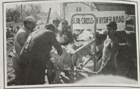
Cattle health Camp for rescued cattle