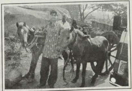
Working horses get help!

In February 2000 Blue Cross started a mobile Veterinary service for equines funded by the Brooke Hospitals for Animals (U.K.) . This service extends veterinary care to working equines in and around the twin cities four days a week, treating on an average 300 horses every month. The efforts have proved very helpful to poor cart owners and their horses.