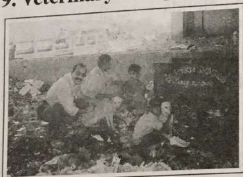
Vaccination Camps for street dogs

7 Camps were conducted where 141 cows and buffaloes were treated and 339 dogs were vaccinated against rabies.