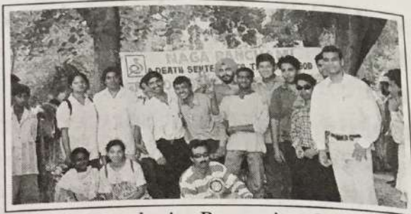
Nagpanchmi – Preventing Cruelty

The Blue Cross rescued 2 Sloth bears from street shows and was responsible for rehabilitating them into zoos. We also rescued 43 wildlife illegally captured. 6 Snakes were rescued and released during the cruelties at Nagpanchami. Our volunteers make regular efforts to educate people against various cruelties.