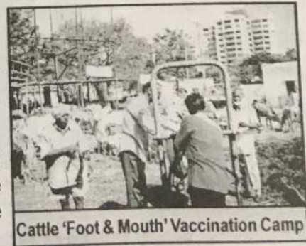
Cattle 'Foot & Mouth' Vaccination Camp

6. A Veterinary Camp was conducted at Ghasmandi where more than 250 bullocks come in from the surrounding villages carrying fodder. 52 Bullocks were given Veterinary treatment.