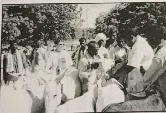
Camp at Dharma Donkey Sanctuary

In addition, last year two IECC (Intensive Equine Care Camp) were conducted one was at Nanded Gurudwara where 37 horses were treated (dewormed, vaccinated) and other ailments like minor surgical conditions were addressed. Our farriery also trimmed