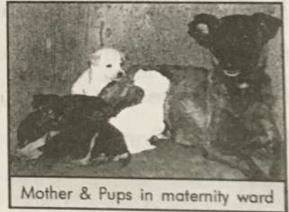
Mother & Pups in maternity ward