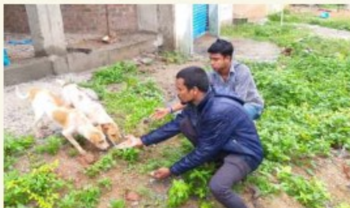
Approaching strays in a Humane manner by our catching team

I became a part of Blue cross of Hyderabad in September 2018, which was an honour for me. The first three months were hectic, but we still managed to reach the target number assigned, for the Animal Birth Control/Anti-Rabies Vaccination program. Targets are necessary to make a budget work.