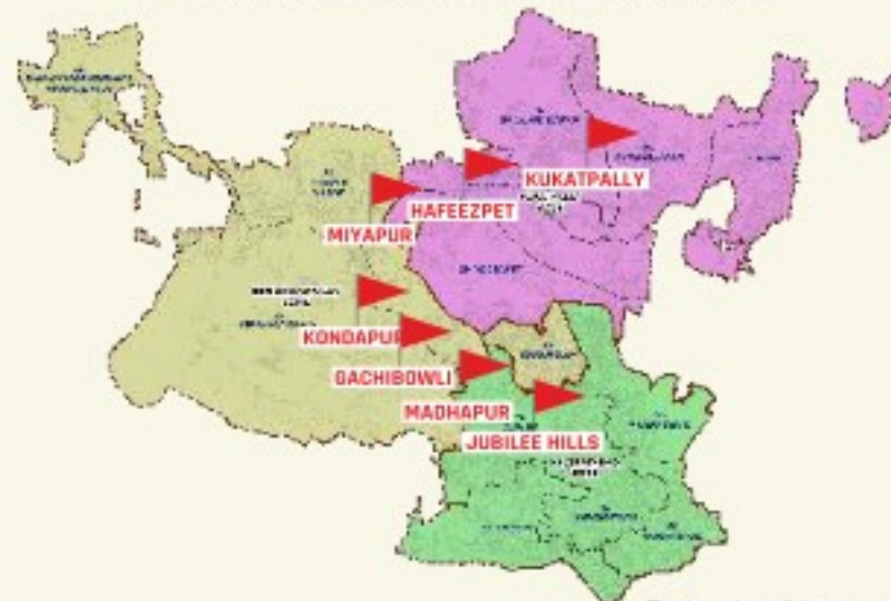
Numbers of Dogs Sterilized and Vaccinated area wise... 2018-19

Total number of dogs operated 8198 (3910 Male, 4288 Female)