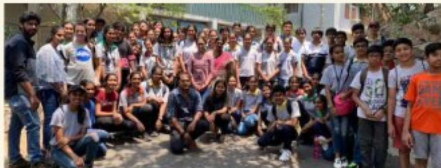
Chirec School Students visit to Blue Cross

Apart from our existing volunteers, this year we had 102 people join as volunteers. Many sign up for a month or 3 months and then move away. Through our volunteers, we are creating a better world for animals, and every time people volunteer they are fueled by love.